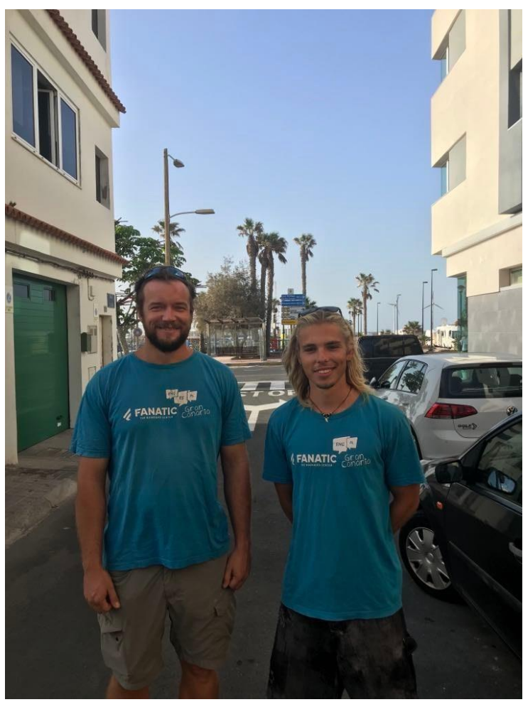
I grant Erasmus for Young Entrepreneurs Support Office the right to use my story in its publications